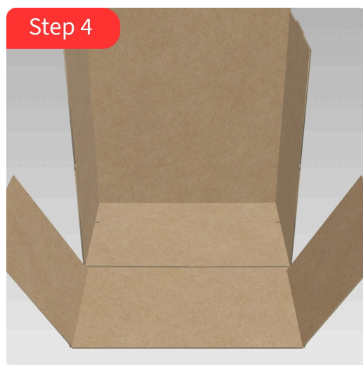
Step 4: Fold the two end flaps up at the crease.