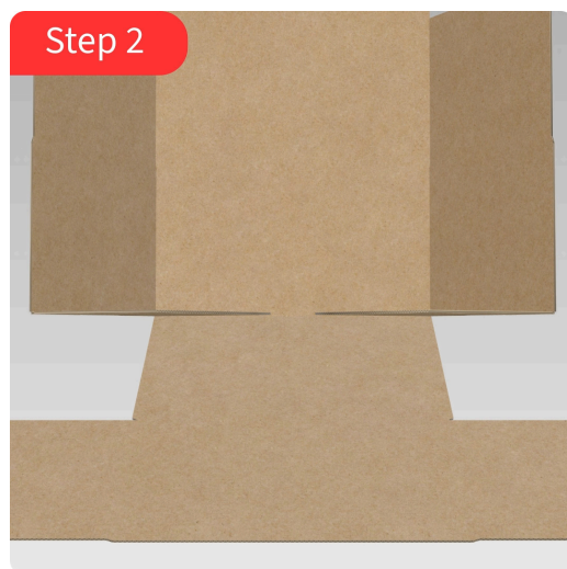
Step 2: With both middle flaps at a 90 degree angle, fold the adjacent sides where the box creases.