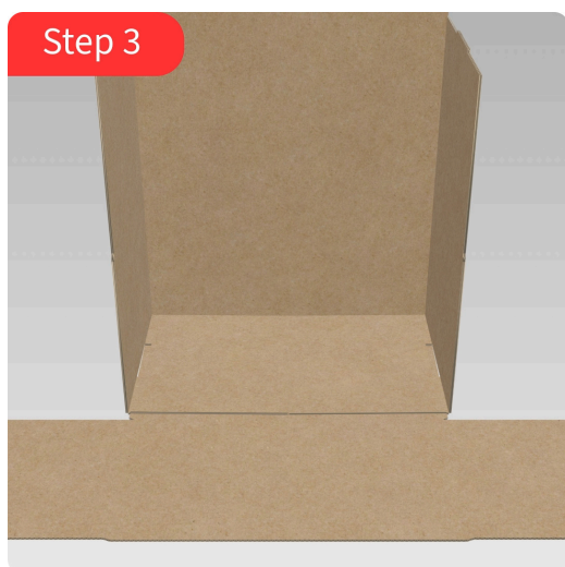
Step 3: Fold the the adjacent sides until they are at at 90 degree angle. Both middle flaps should be overlapping now.