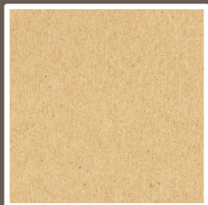
20# Smooth Kraft Strong and flexible paper for most parts; recyclable.