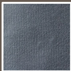
Blue Plush Brushed Polyester fabric; highest durability and surface protection.