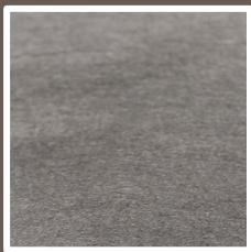
Evolon Thread-free Spunbond; highest protection for sensitive surfaces .