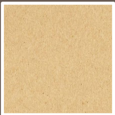
20# Smooth Kraft Strong and flexible paper for most parts; recyclable.