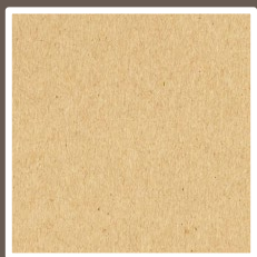
20# Smooth Kraft Strong and flexible paper for most parts; recyclable.