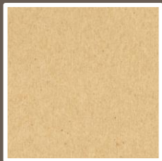
20# Smooth Kraft Strong and flexible paper for most parts; recyclable.