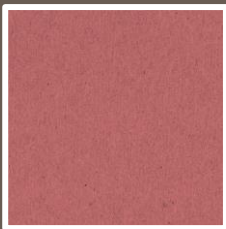
20# Smooth Kraft Nomar Smooth kraft with added part protecting coating; recyclable.