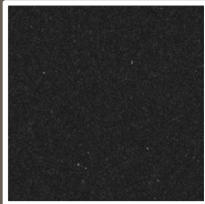
20# Smooth Kraft ESD Smooth kraft with added part electrostatic discharging coating; recyclable.