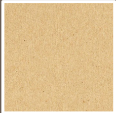
20# Smooth Kraft Strong and flexible paper for most parts; recyclable.