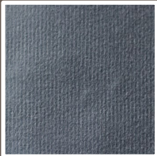
Blue Plush Brushed Polyester fabric; highest durability and surface protection.