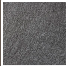
LX 15025 Spunbond PP fabric is durable and cost effective.