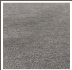
Evolon Thread-free Spunbond; highest protection for sensitive surfaces .