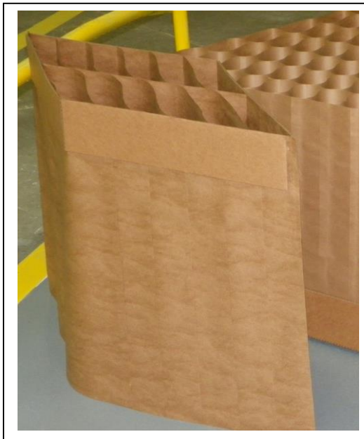
Pop and Drop – ready to drop into a box or tote

In The Box expendable dividers come preinstalled into a corrugated box. Boxes can be shipped flat with the divider inside. They arrive at their destination ready to open and use.