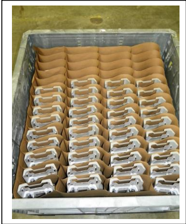
Expendable divider in a bulk bin