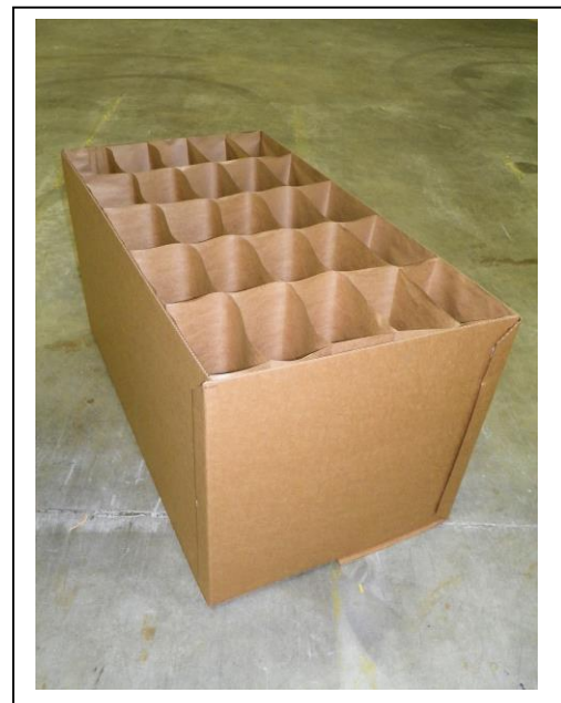
In The Box Kraft Divider