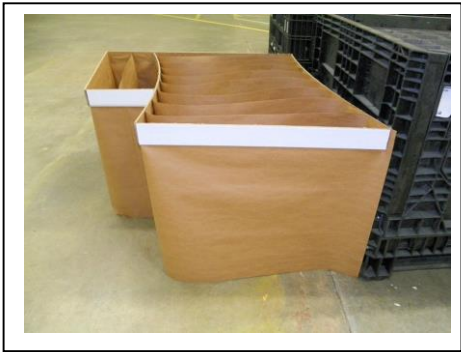
Expendable bulk bin divider with 3" paperboard frame

Corrugated bottom fold-under frames are the only frame option available for bulk bin expendable dividers. The fold-under frame locks into place allowing the divider to be held in the open position. It can then be easily picked up and dropped into a bulk bin.